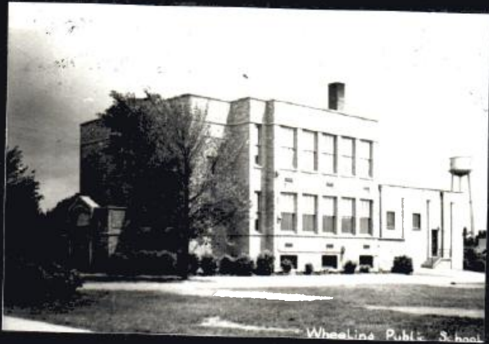
Wheeling Public School