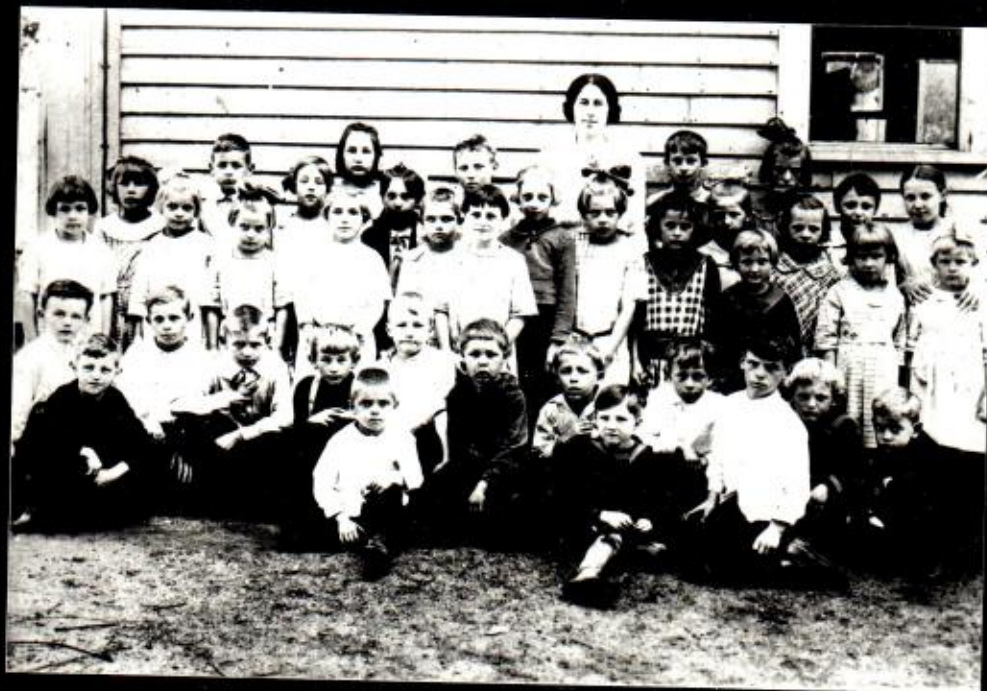
Wheeling School picture 1921