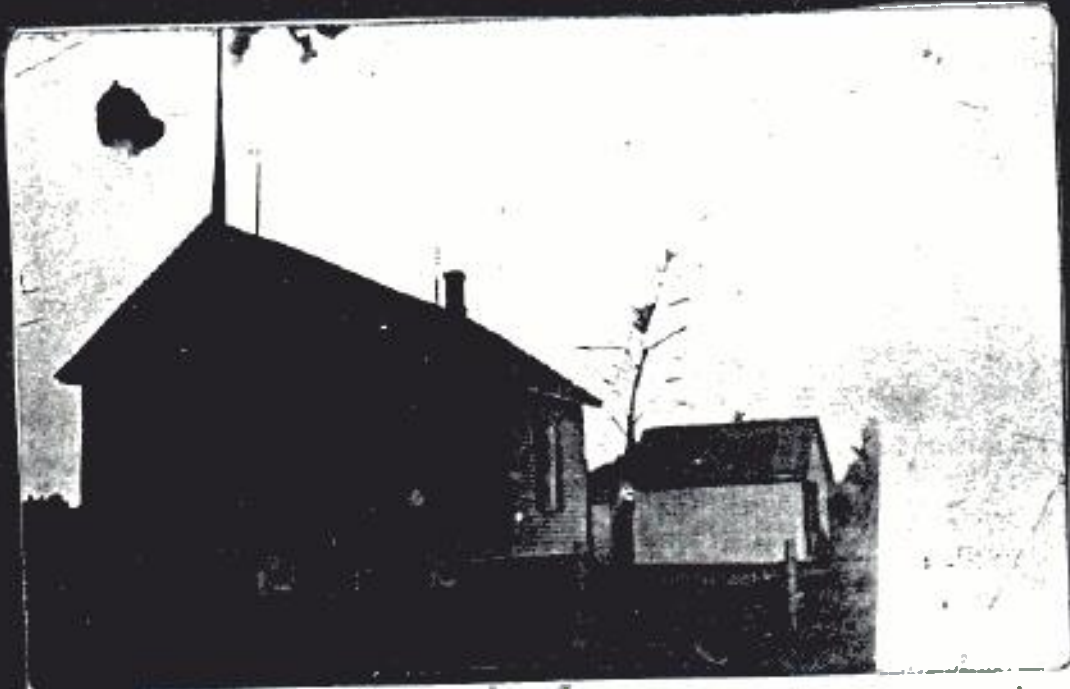
Strong School (Milw. & Palatine)